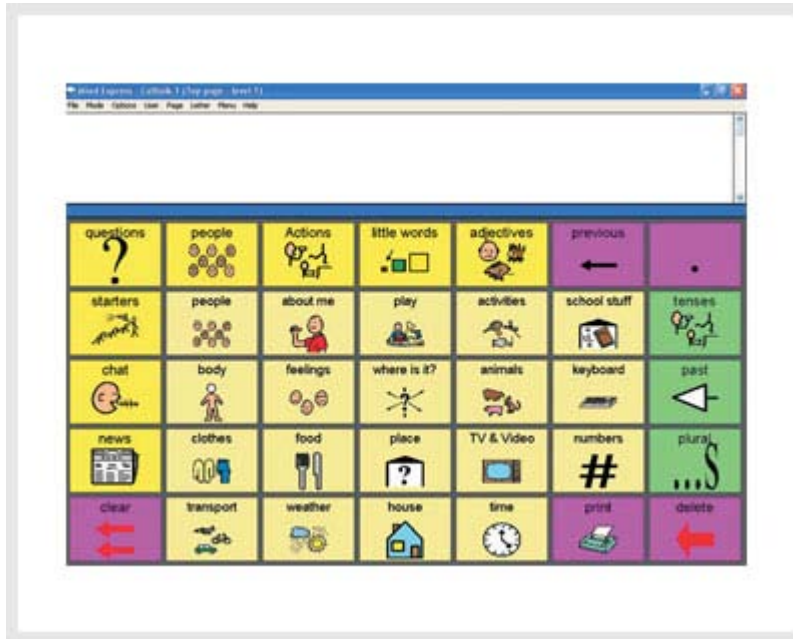
CALLtalk screen capture