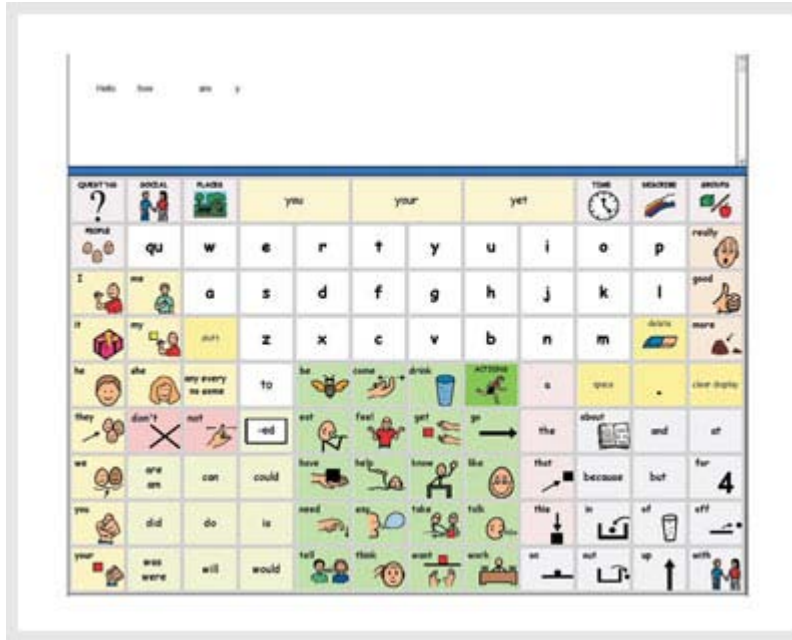
Picture WordPower screen capture